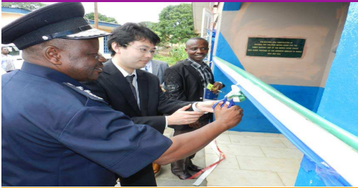
Inspector General of the SLP cutting tape on one of the Family Support Unit Buildings constructed by DCI