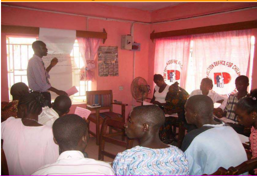
Child Rights sensitization with children