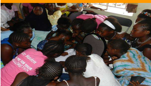
Life Skills Session with girls