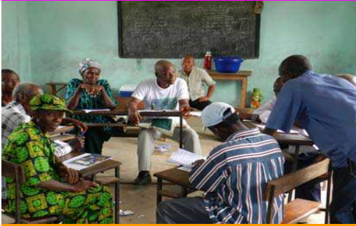
CWC Meeting in one of DCI's community