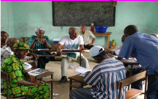
CWC Meeting in one of DCI's community