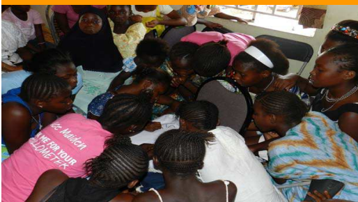
Life Skills Session with girls