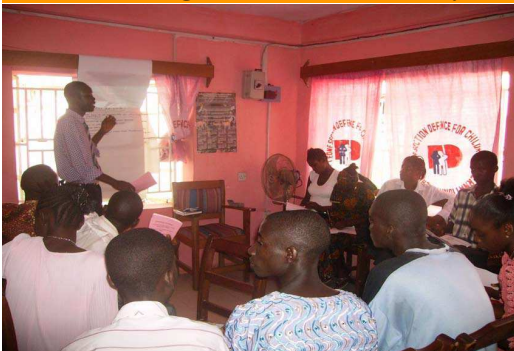
Child Rights sensitization with children