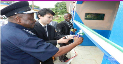
Inspector General of the SLP cutting tape on one of the Family Support Unit Buildings constructed by DCI